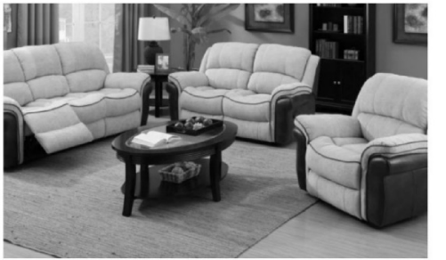
Holmes Hill Estate Whitesmith East Sussex, BN8 6JA